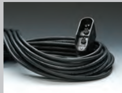
150' Remote Cord