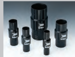
Hose Swivels 2-6" Available