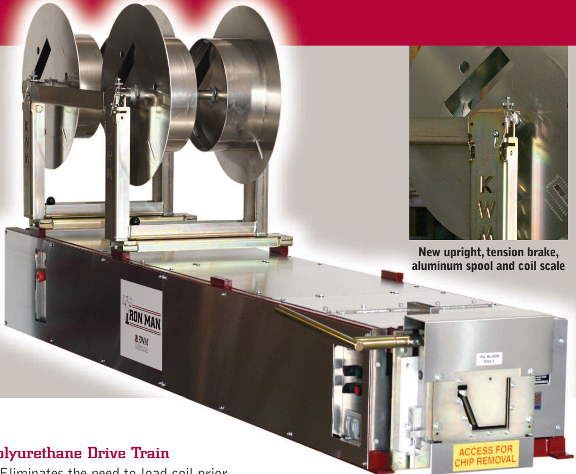
New upright, tension brake, aluminum spool and coil scale