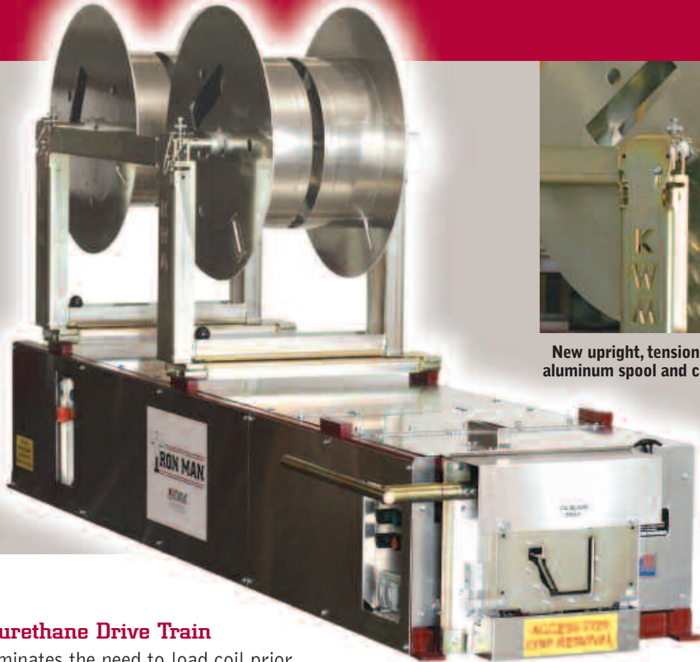
New upright, tension brake, aluminum spool and coil scale